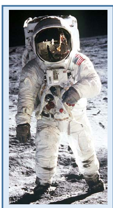
Sure, Buzz walked on the Moon, but he never went to VBS here at Faith Fellowship!

Feel free to plan extra activities (drama, puppets, etc) that coordinate with the main idea of each daily lesson. Be sure the activities are age appropriate for your cadets in training.